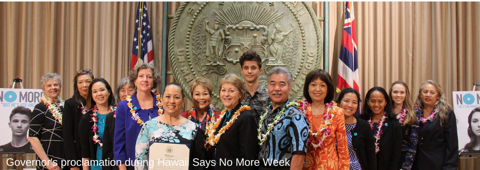
Governor's proclamation during Hawaii Says No More Week

HAWAII STATE COALITION AGAINST DOMESTIC VIOLENCE